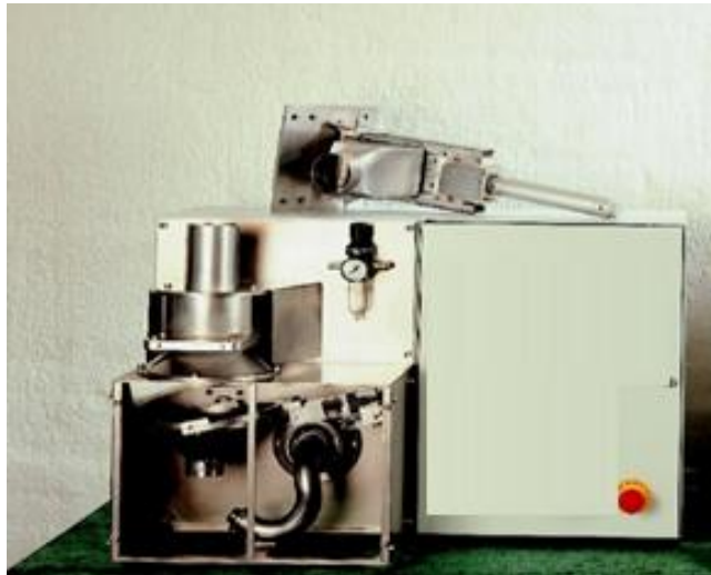
PDI Tester with controller and sample taker

The Daniit Online Quality System (DOQS) is developed for the purpose of testing the quality of pellets i.e. the so-called Pellet Durability Index (PDI) within Animal feed, Pet food and Aqua feed industries, and to measure the level of fines in the process.